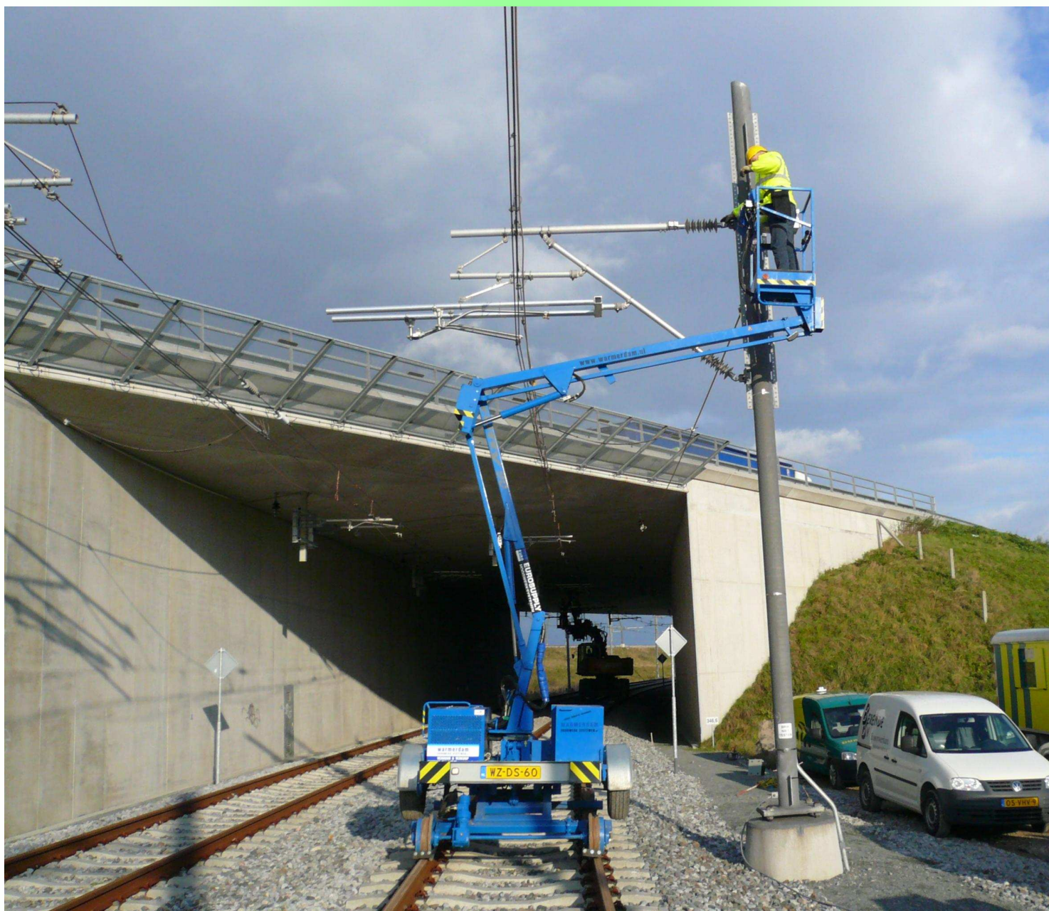
Trailer mounted rail platform